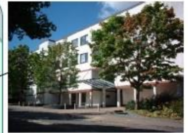
53. Ramphal Building (Main Conference Venue)