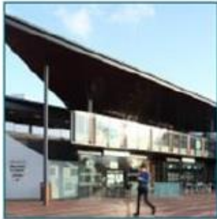
63. Conference Reception (Accommodation checkin)