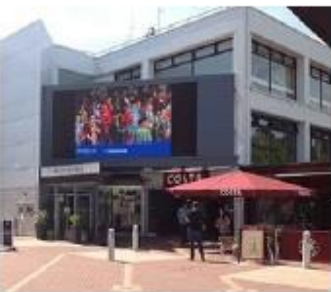
55. Rootes Building (Catering & Pub Quiz)